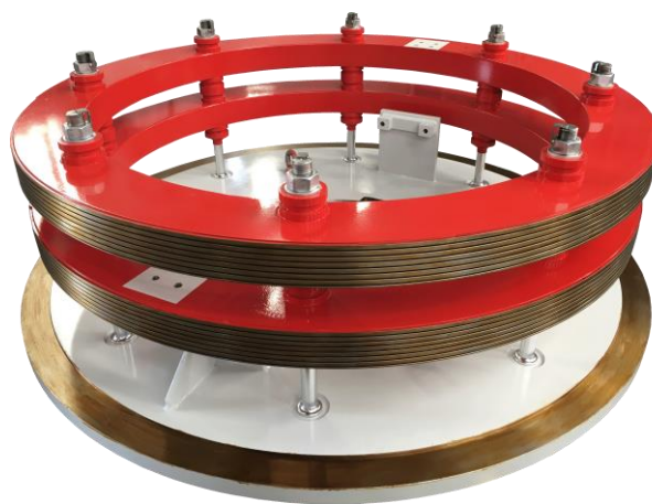
1,600 mm diameter steel slip ring

It is therefore essential to design them while considering both the electrical and mechanical requirements, as well as operating environment parameters, while also keeping in mind the customer's final needs.